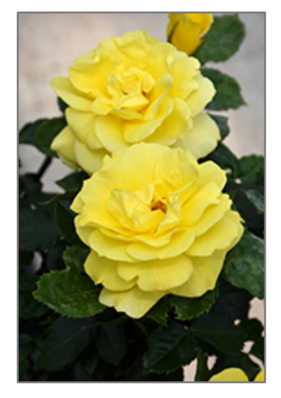
Sunsprite Rose flowers

CustomerCare@WestonNurseries.com 93 East Main Street Hopkinton MA 02148 - (508) 435-3414 160 Pine Hill Road Chelmsford MA 01824 - (978) 349-0055 COMMERCIAL: commsales@westonnurseries.com - (508) 293-8028