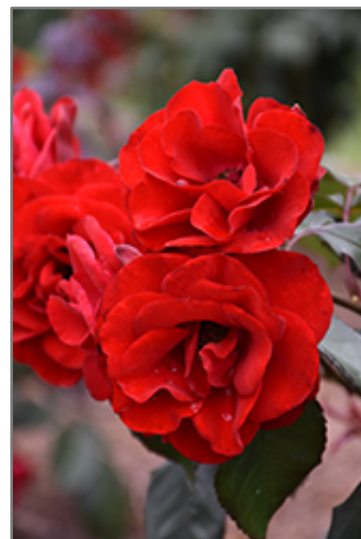
Europeana Rose flowers

The Europeana Rose is recommended for the following landscape applications;