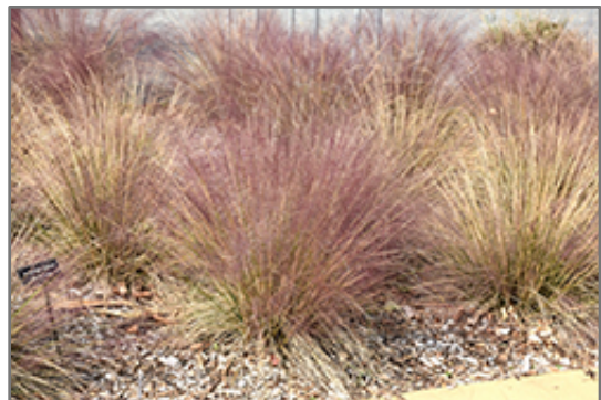
Hairawn Muhly in fall