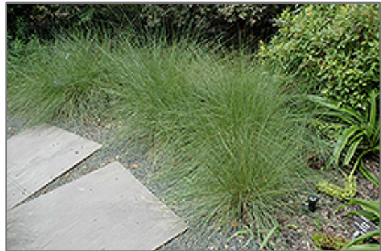
Hairawn Muhly

Hairawn Muhly is recommended for the following landscape applications;