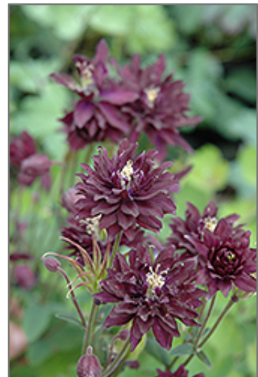
Clementine Dark Purple Columbine flowers