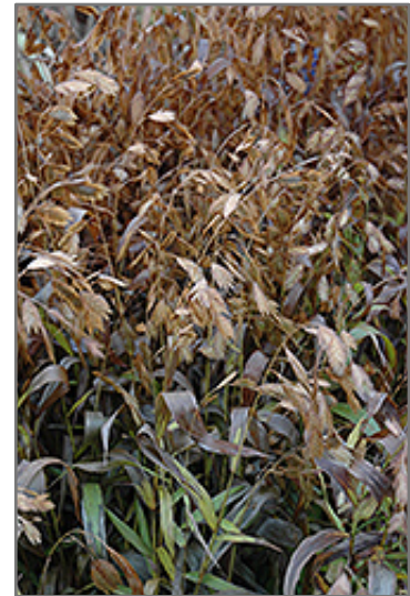
Northern Sea Oats in fall

Northern Sea Oats is recommended for the following landscape applications;