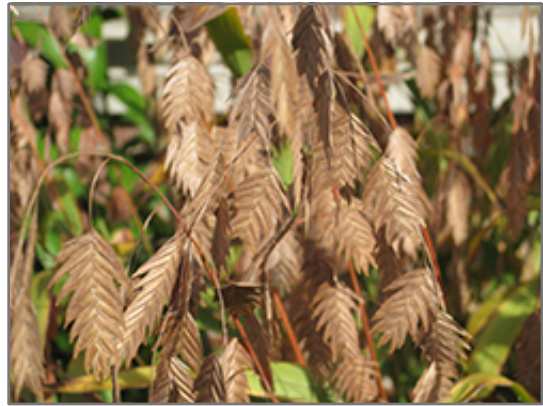
Northern Sea Oats fruit

Northern Sea Oats will grow to be about 4 feet tall at maturity, with a spread of 30 inches. Its foliage tends to remain dense right to the ground, not requiring facer plants in front. It grows at a medium rate, and under ideal conditions can be expected to live for approximately 10 years. As an herbaceous perennial, this plant will usually die back to the crown each winter, and will regrow from the base each spring. Be careful not to disturb the crown in late winter when it may not be readily seen!