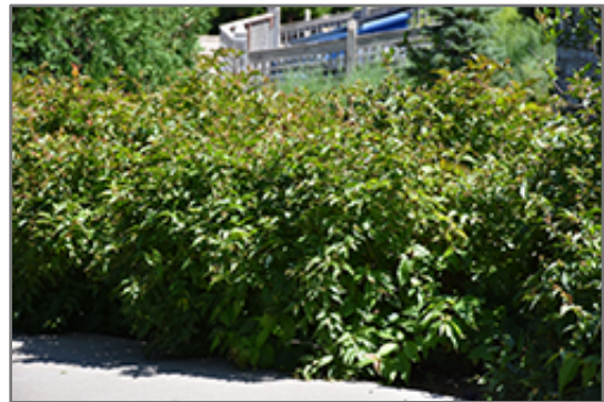
Copper Bush Honeysuckle