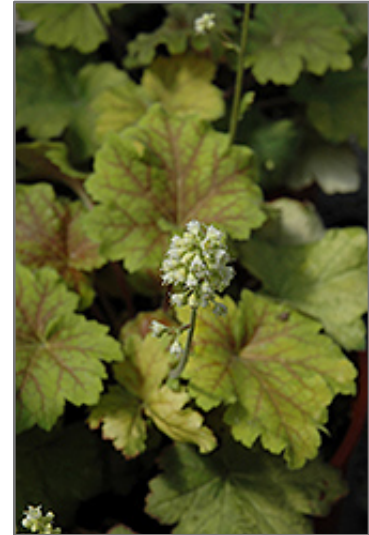
Electra Coral Bells flowers

Electra Coral Bells is recommended for the following landscape applications;