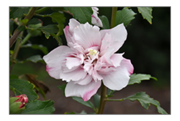
Lady Stanley Rose of Sharon flowers

Lady Stanley Rose of Sharon is recommended for the following landscape applications;