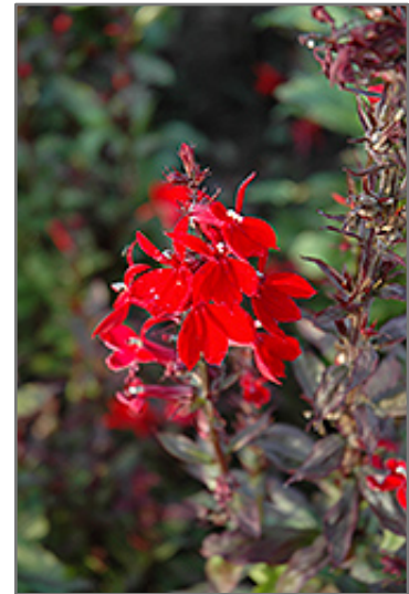
Queen Victoria Lobelia flowers