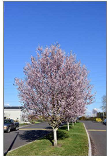
Krauter Vesuvius Plum in bloom