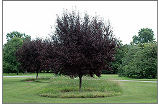
Krauter Vesuvius Plum

This tree should only be grown in full sunlight. It does best in average to evenly moist conditions, but will not tolerate standing water. It is not particular as to soil type or pH. It is highly tolerant of urban pollution and will even thrive in inner city environments. This is a selected variety of a species not originally from North America.