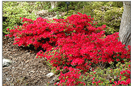
Hino Crimson Azalea in bloom