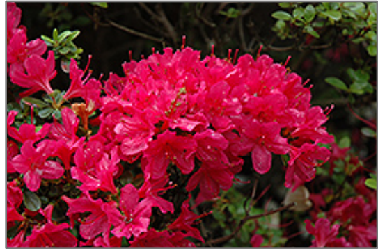
Hino Crimson Azalea flowers

This shrub does best in full sun to partial shade. You may want to keep it away from hot, dry locations that receive direct afternoon sun or which get reflected sunlight, such as against the south side of a white wall. It requires an evenly moist well-drained soil for optimal growth, but will die in standing water. It is very fussy about its soil conditions and must have rich, acidic soils to ensure success, and is subject to chlorosis (yellowing) of the foliage in alkaline soils. It is somewhat tolerant of urban pollution, and will benefit from being planted in a relatively sheltered location. Consider applying a thick mulch around the root zone in winter to protect it in exposed locations or colder microclimates. This particular variety is an interspecific hybrid.