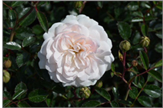
Sea Foam Rose flowers