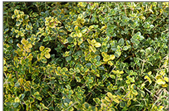
Doone Valley Thyme