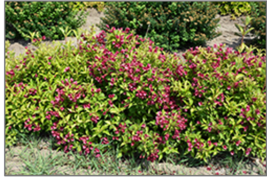
Ghost Weigela in bloom

This shrub should only be grown in full sunlight. It prefers to grow in average to moist conditions, and shouldn't be allowed to dry out. It is not particular as to soil type or pH. It is highly tolerant of urban pollution and will even thrive in inner city environments. This is a selected variety of a species not originally from North America.