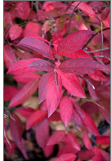
Henry's Garnet Virginia Sweetspire in fall

This shrub performs well in both full sun and full shade. It is an amazingly adaptable plant, tolerating both dry conditions and even some standing water. It is not particular as to soil type or pH. It is somewhat tolerant of urban pollution. This is a selection of a native North American species.