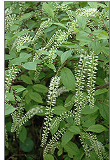
Henry's Garnet Virginia Sweetspire flowers

Henry's Garnet Virginia Sweetspire is recommended for the following landscape applications;