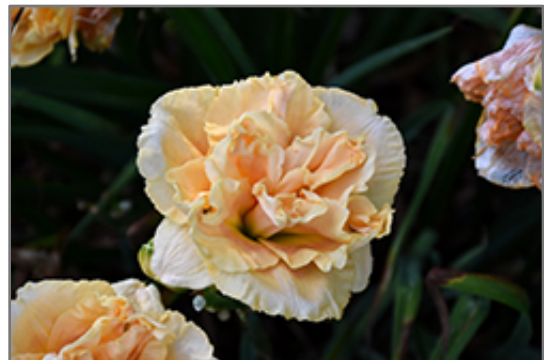
Rainbow Rhythm Siloam Peony Display Daylily flowers