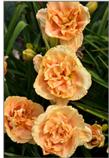
Rainbow Rhythm Siloam Peony Display Daylily flowers

Rainbow Rhythm Siloam Peony Display Daylily is recommended for the following landscape applications;