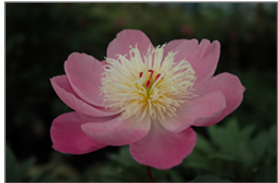
Edulis Superba Peony flowers