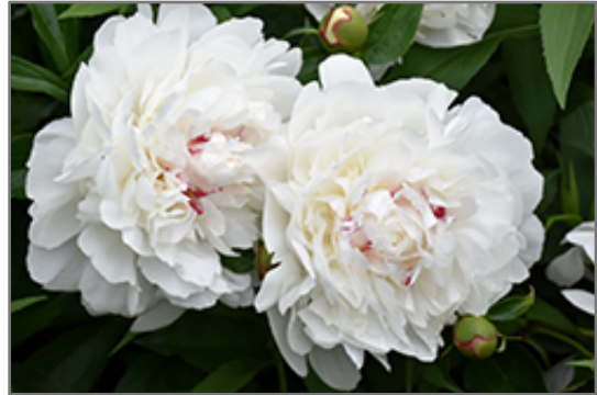
Festiva Maxima Peony flowers

Festiva Maxima Peony is recommended for the following landscape applications;