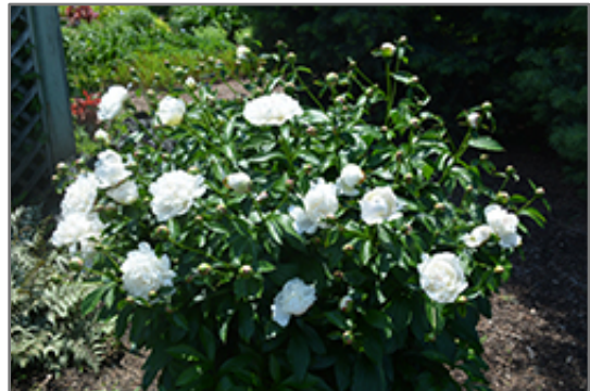
Festiva Maxima Peony in bloom