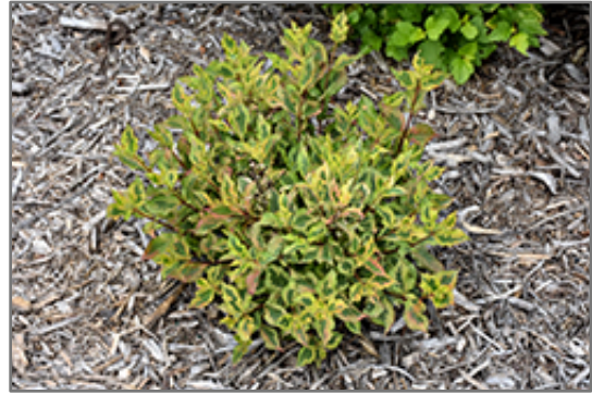
Rainbow Sensation Weigela

Rainbow Sensation Weigela makes a fine choice for the outdoor landscape, but it is also well-suited for use in outdoor pots and containers. Because of its height, it is often used as a 'thriller' in the 'spiller-thriller-filler' container combination; plant it near the center of the pot, surrounded by smaller plants and those that spill over the edges. It is even sizeable enough that it can be grown alone in a suitable container. Note that when grown in a container, it may not perform exactly as indicated on the tag - this is to be expected. Also note that when growing plants in outdoor containers and baskets, they may require more frequent waterings than they would in the yard or garden.