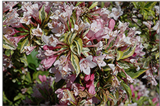
Rainbow Sensation Weigela flowers

Rainbow Sensation Weigela is recommended for the following landscape applications;