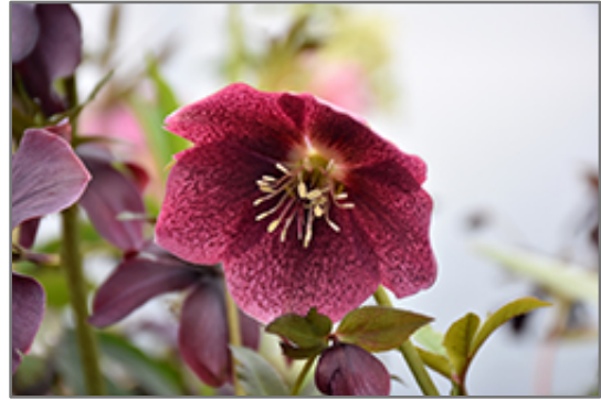
Blue Lady Hellebore flowers