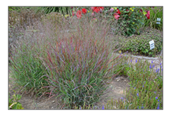
Cheyenne Sky Switch Grass

Cheyenne Sky Switch Grass is recommended for the following landscape applications;