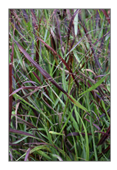
Cheyenne Sky Switch Grass flowers

CustomerCare@WestonNurseries.com 93 East Main Street Hopkinton MA 02148 - (508) 435-3414 160 Pine Hill Road Chelmsford MA 01824 - (978) 349-0055 COMMERCIAL: commsales@westonnurseries.com - (508) 293-8028