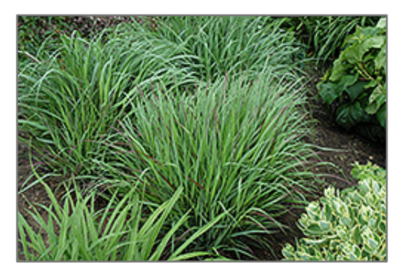
Cheyenne Sky Switch Grass

Cheyenne Sky Switch Grass will grow to be about 24 inches tall at maturity extending to 3 feet tall with the flowers, with a spread of 24 inches. It tends to be leggy, with a typical clearance of 1 foot from the ground, and should be underplanted with lower-growing perennials. It grows at a medium rate, and under ideal conditions can be expected to live for approximately 15 years. As an herbaceous perennial, this plant will usually die back to the crown each winter, and will regrow from the base each spring. Be careful not to disturb the crown in late winter when it may not be readily seen!