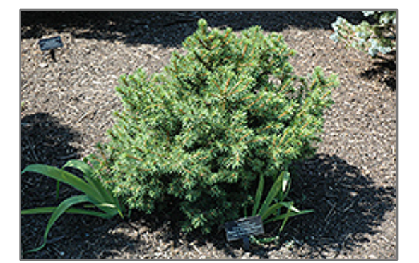
Gregoryana Parsonii Norway Spruce

CustomerCare@WestonNurseries.com 93 East Main Street Hopkinton MA 02148 - (508) 435-3414 160 Pine Hill Road Chelmsford MA 01824 - (978) 349-0055 COMMERCIAL: commsales@westonnurseries.com - (508) 293-8028