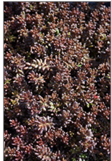
Murale Stonecrop foliage