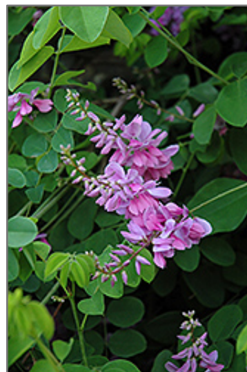
Chinese Indigo flowers