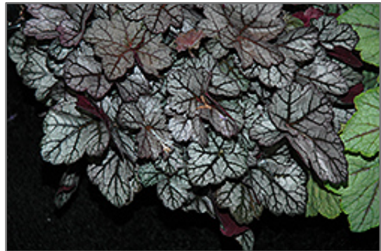
Glitter Coral Bells foliage