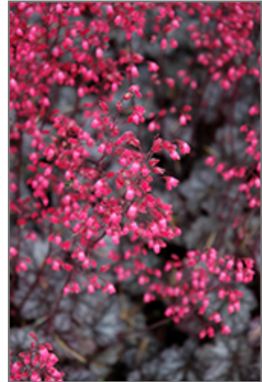
Glitter Coral Bells flowers

Glitter Coral Bells will grow to be about 10 inches tall at maturity extending to 16 inches tall with the flowers, with a spread of 14 inches. When grown in masses or used as a bedding plant, individual plants should be spaced approximately 12 inches apart. Its foliage tends to remain low and dense right to the ground. It grows at a medium rate, and under ideal conditions can be expected to live for approximately 10 years. As an evergreen perennial, this plant will typically keep its form and foliage year-round.