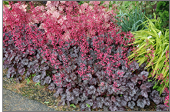
Glitter Coral Bells in bloom

This is a relatively low maintenance plant, and should be cut back in late fall in preparation for winter. It is a good choice for attracting hummingbirds to your yard. It has no significant negative characteristics.