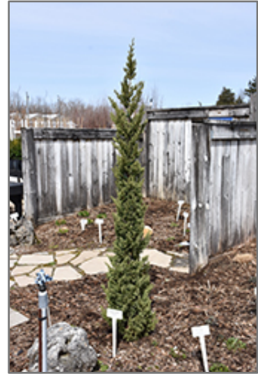
Trautman Juniper

This shrub should only be grown in full sunlight. It is very adaptable to both dry and moist growing conditions, but will not tolerate any standing water. It is not particular as to soil type or pH. It is highly tolerant of urban pollution and will even thrive in inner city environments. This is a selected variety of a species not originally from North America.