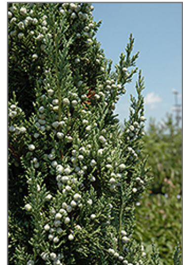
Trautman Juniper fruit