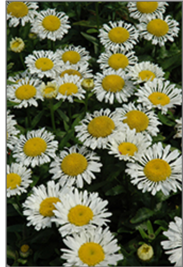
Lacrosse Shasta Daisy flowers