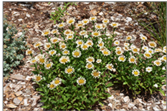
Lacrosse Shasta Daisy in bloom