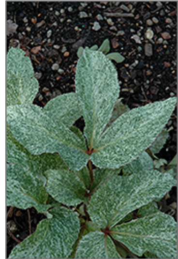
Snow Fever Hellebore foliage