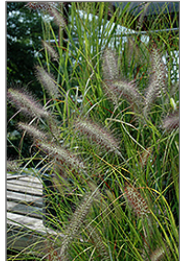
Cassian Dwarf Fountain Grass flowers