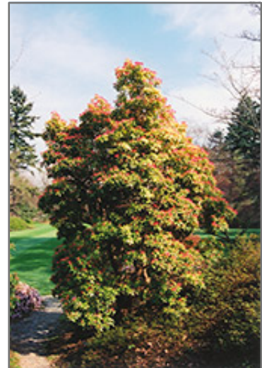
Valley Fire Japanese Pieris

This shrub does best in full sun to partial shade. It requires an evenly moist well-drained soil for optimal growth, but will die in standing water. It is very fussy about its soil conditions and must have rich, acidic soils to ensure success, and is subject to chlorosis (yellowing) of the foliage in alkaline soils. It is somewhat tolerant of urban pollution, and will benefit from being planted in a relatively sheltered location. Consider applying a thick mulch around the root zone in winter to protect it in exposed locations or colder microclimates. This is a selected variety of a species not originally from North America, and parts of it are known to be toxic to humans and animals, so care should be exercised in planting it around children and pets.