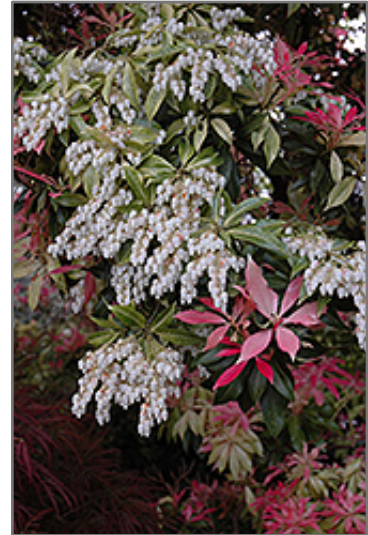
Valley Fire Japanese Pieris flowers

Valley Fire Japanese Pieris is recommended for the following landscape applications;