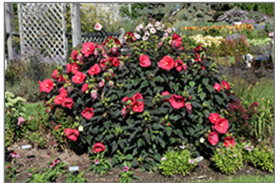
Mars Madness Hibiscus in bloom