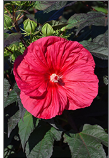
Mars Madness Hibiscus flowers

This plant will require occasional maintenance and upkeep, and should be cut back in late fall in preparation for winter. It is a good choice for attracting butterflies and hummingbirds to your yard, but is not particularly attractive to deer who tend to leave it alone in favor of tastier treats. Gardeners should be aware of the following characteristic(s) that may warrant special consideration;