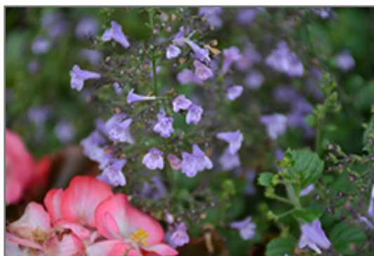
Marvelette Blue Dwarf Calamint flowers