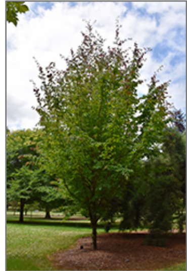
Ruby Vase Parrotia