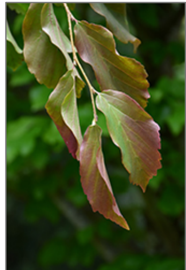
Ruby Vase Parrotia foliage