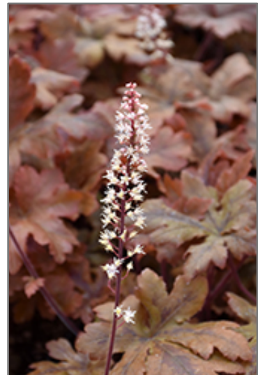
Hopscotch Foamy Bells flowers