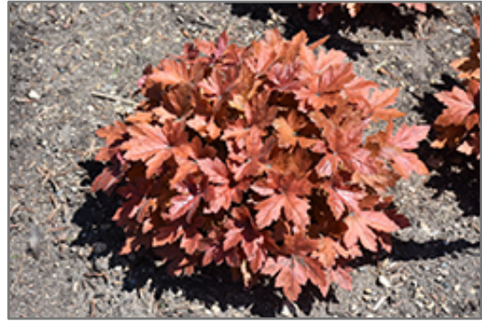
Hopscotch Foamy Bells

Hopscotch Foamy Bells will grow to be about 12 inches tall at maturity extending to 20 inches tall with the flowers, with a spread of 20 inches. When grown in masses or used as a bedding plant, individual plants should be spaced approximately 18 inches apart. Its foliage tends to remain dense right to the ground, not requiring facer plants in front. It grows at a medium rate, and under ideal conditions can be expected to live for approximately 10 years. As an evergreen perennial, this plant will typically keep its form and foliage year-round.