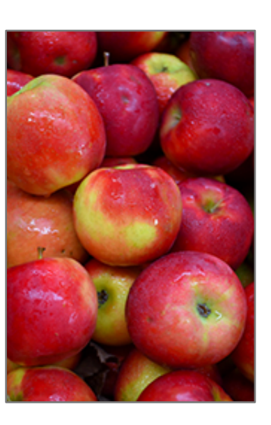
Crimson Crisp Apple fruit