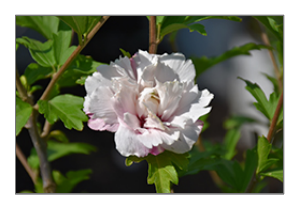
French Cabaret Blush Rose of Sharon flowers