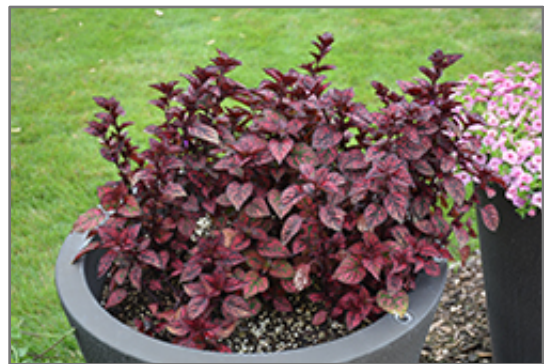
Hippo Red Polka Dot Plant