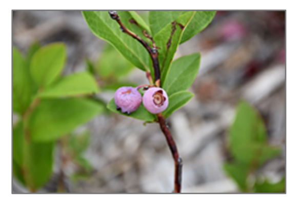
Pink Popcorn Blueberry fruit

CustomerCare@WestonNurseries.com 93 East Main Street Hopkinton MA 02148 - (508) 435-3414 160 Pine Hill Road Chelmsford MA 01824 - (978) 349-0055 COMMERCIAL: commsales@westonnurseries.com - (508) 293-8028