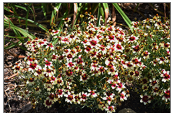
Sizzle And Spice Red Hot Vanilla Tickseed in bloom