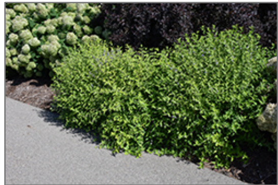
Sunshine Blue II Caryopteris in bloom