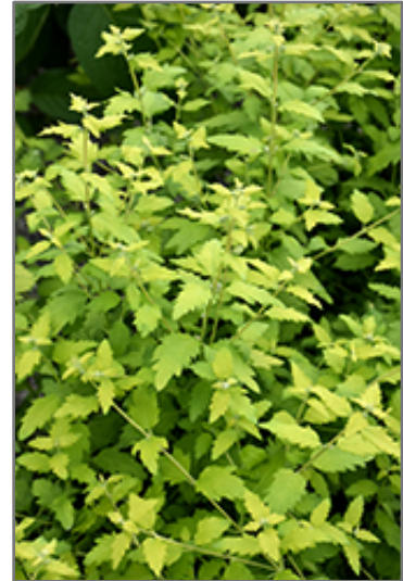
Sunshine Blue II Caryopteris foliage

Sunshine Blue II Caryopteris makes a fine choice for the outdoor landscape, but it is also well-suited for use in outdoor pots and containers. With its upright habit of growth, it is best suited for use as a 'thriller' in the 'spiller-thriller-filler' container combination; plant it near the center of the pot, surrounded by smaller plants and those that spill over the edges. It is even sizeable enough that it can be grown alone in a suitable container. Note that when grown in a container, it may not perform exactly as indicated on the tag - this is to be expected. Also note that when growing plants in outdoor containers and baskets, they may require more frequent waterings than they would in the yard or garden.