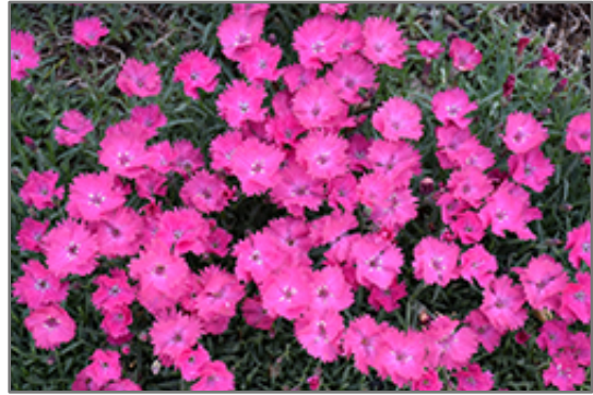
Vivid Bright Light Pinks flowers

Vivid Bright Light Pinks is recommended for the following landscape applications;