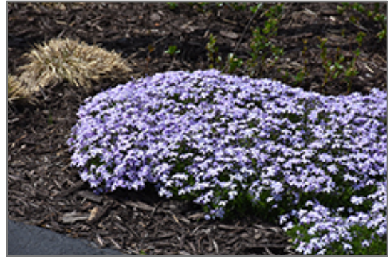
Spring Blue Moss Phlox in bloom