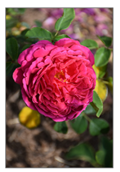
Othello Rose flowers