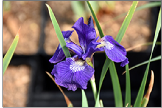
Blue King Siberian Iris flowers