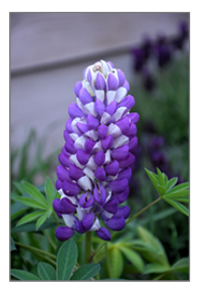
Mini Gallery Blue Bicolor Lupine flowers

CustomerCare@WestonNurseries.com 93 East Main Street Hopkinton MA 02148 - (508) 435-3414 160 Pine Hill Road Chelmsford MA 01824 - (978) 349-0055 COMMERCIAL: commsales@westonnurseries.com - (508) 293-8028