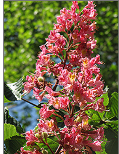
Red Horse Chestnut flowers