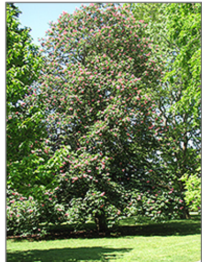
Red Horse Chestnut in bloom