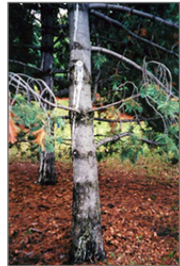
Whitebark Pine bark