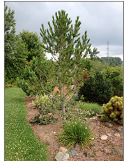
Whitebark Pine