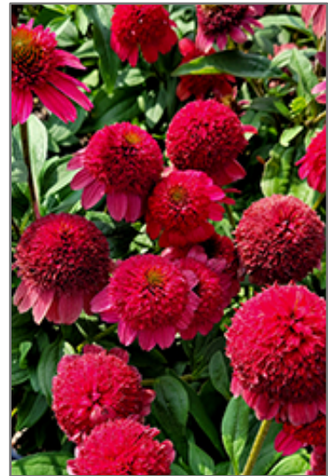
Sunny Days Ruby Coneflower flowers

This is a relatively low maintenance plant, and is best cleaned up in early spring before it resumes active growth for the season. It is a good choice for attracting butterflies to your yard, but is not particularly attractive to deer who tend to leave it alone in favor of tastier treats. It has no significant negative characteristics.