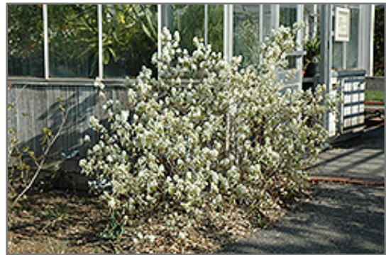
Regent Saskatoon flowers