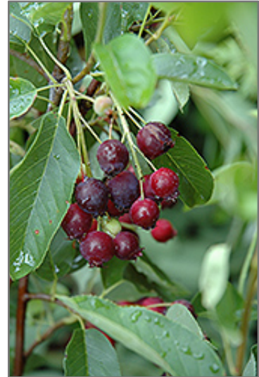
Regent Saskatoon fruit

Regent Saskatoon is blanketed in stunning clusters of white flowers rising above the foliage from early to mid spring before the leaves. It has dark green deciduous foliage. The oval leaves turn an outstanding yellow in the fall. It features an abundance of magnificent blue berries from late spring to early summer.