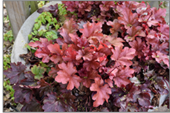
Peach Flambe Coral Bells

Peach Flambe Coral Bells will grow to be about 8 inches tall at maturity extending to 16 inches tall with the flowers, with a spread of 16 inches. When grown in masses or used as a bedding plant, individual plants should be spaced approximately 14 inches apart. Its foliage tends to remain low and dense right to the ground. It grows at a medium rate, and under ideal conditions can be expected to live for approximately 10 years. As an evergreen perennial, this plant will typically keep its form and foliage year-round.