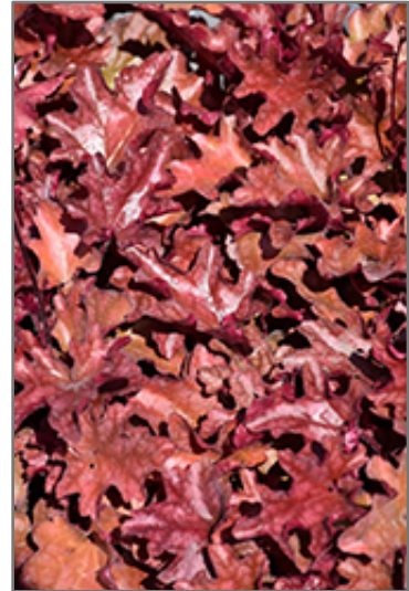
Peach Flambe Coral Bells foliage

This is a relatively low maintenance plant, and should be cut back in late fall in preparation for winter. It is a good choice for attracting hummingbirds to your yard. It has no significant negative characteristics.